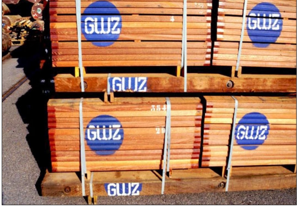
Wijma sawn timber in the Dutch port of Delfzijl.

Once Wijma's sawn timber arrives on the European market, it is impossible for the customer to verify the sustainability, or even legality, of Wijma timber. Logs from legal and illegal sources are easily mixed and could be processed together in Wijma's sawmills in Cameroon or in the Netherlands.